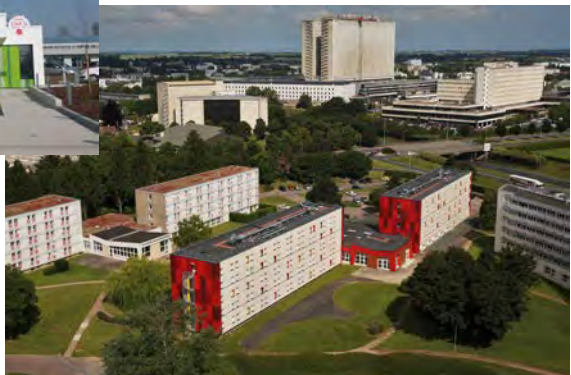
Lébisey University residence