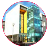
Maison des langues et de l'international Carré international