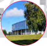
Crous restaurant A