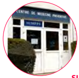
SUMPPS UNICAEN medical center