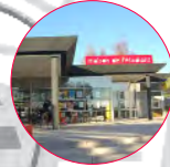
Maison de l'étudiant