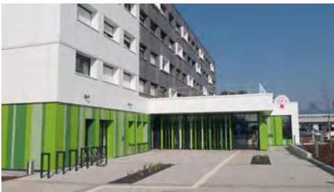
Front desk of the campus 1 residence

http://international.unicaen.fr/etudier-a-caen/etudiants-d-echange/etudiants-echanges-hebergement-970339.kjsp?RH=1580116352912