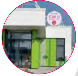
Campus 1 residence Welcome desk